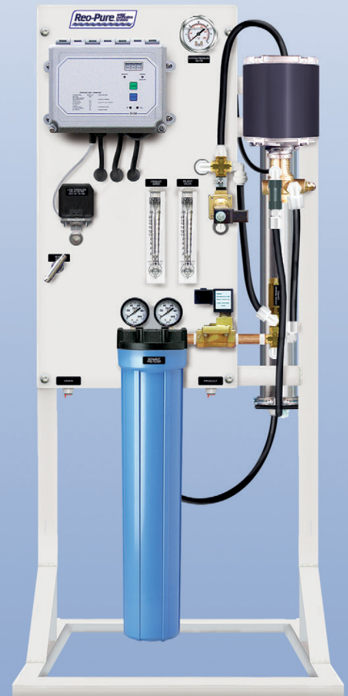
BLS 400 OPTIMUM